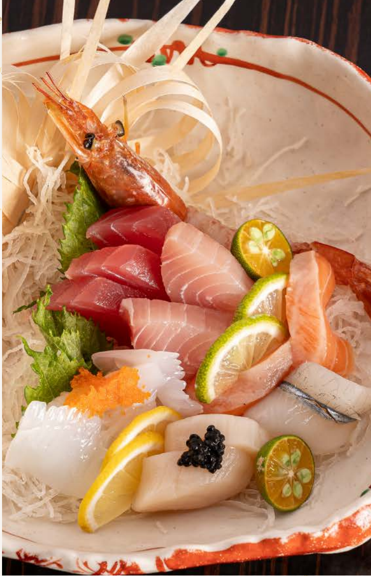
豪華綜合生魚片12片 Premium Sashimi Platter