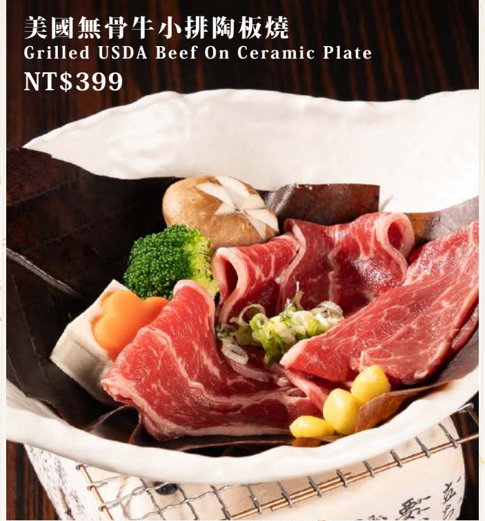
美國無骨牛小排陶板燒 Grilled USDA Beef On Ceramic Plate NT$399