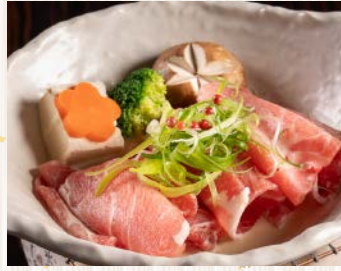
台灣黑豬梅花肉陶板燒 Grilled Sliced Pork Belly On Ceramic Plate NT$320