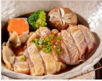
雞腿肉陶板燒 Grilled Chicken Thigh On Ceramic Plate NT$320