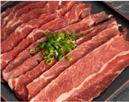
無骨牛小排肉片 Usda Beef Short Rib NT$680