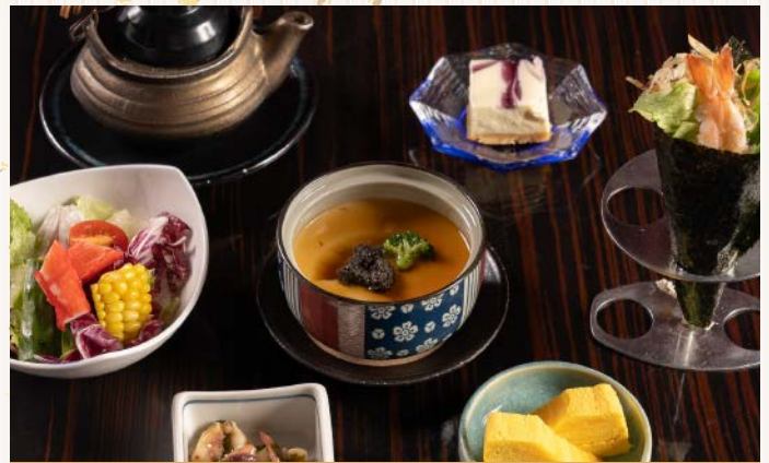
B 定食 單點加價NT$310升級定食B A La Carte Upgrade To Set Menu With Additional NT$310

蟹肉棒和風沙拉 Kanikama Salad With Japanese Messing