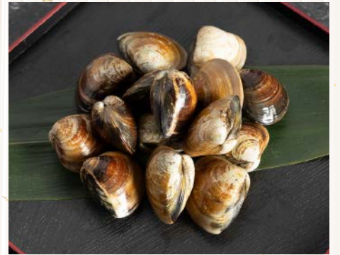
蛤蠣盤 Clam Plate NT$250