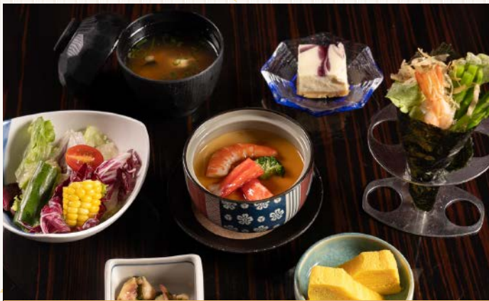
A 定食 單點加價NT$230升級定食A A La Carte Upgrade To Set Menu With Additional NT$230

Choose One Of The Ceramic Plate Flavors: Sesame Sauce, Sukiyaki, Hoba-miso