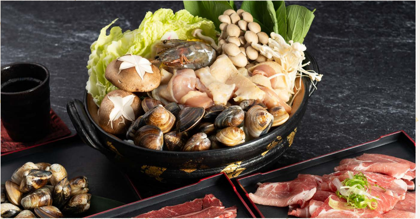
柳町日式火鍋 Yanagi Hot Pot NT$580