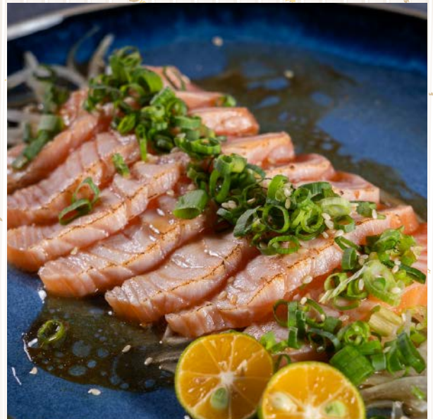
炙燒鮭魚半敲燒 Salmon Tataki

Cod-liver Mix Onions With Orange Vinegar Sauce