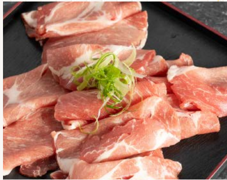
台灣黑豬梅花肉片 Taiwan Pork NT$480